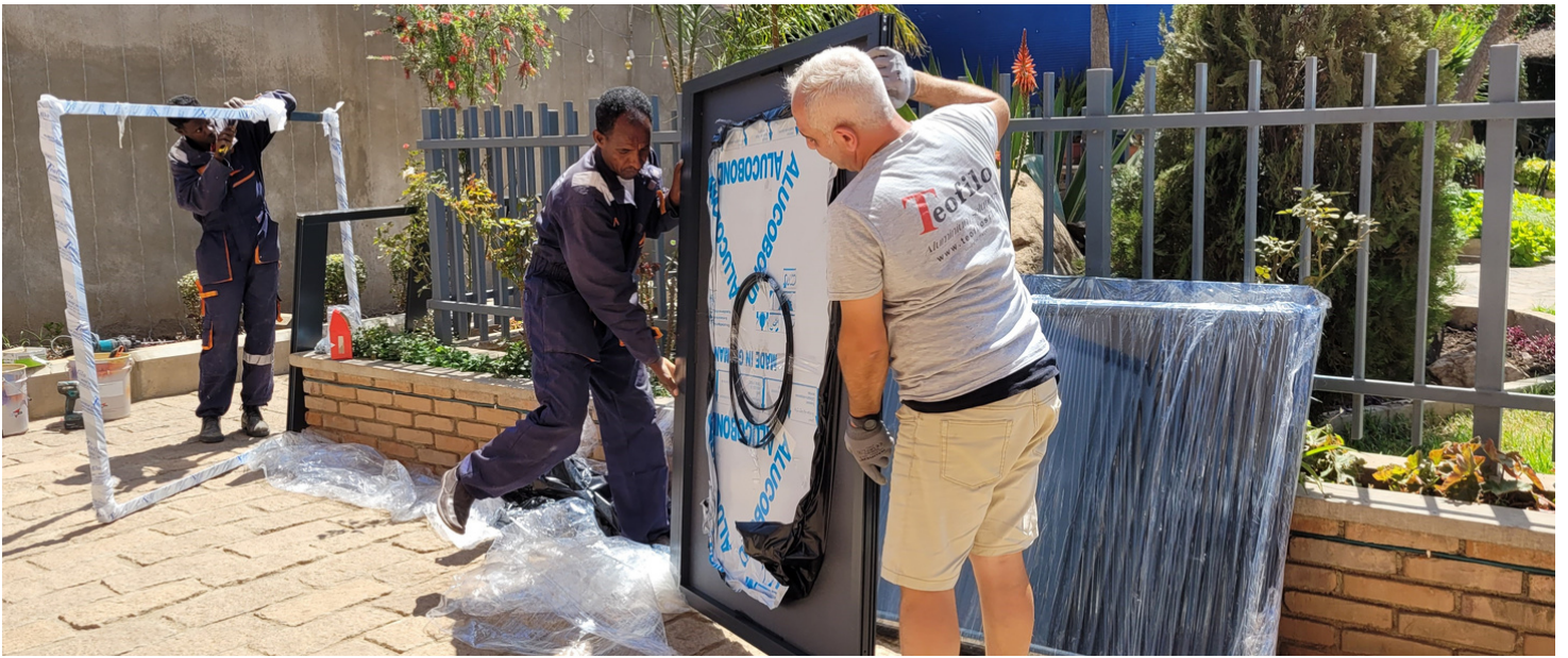
Work in progress to set up the Social Media Centre in Asmara