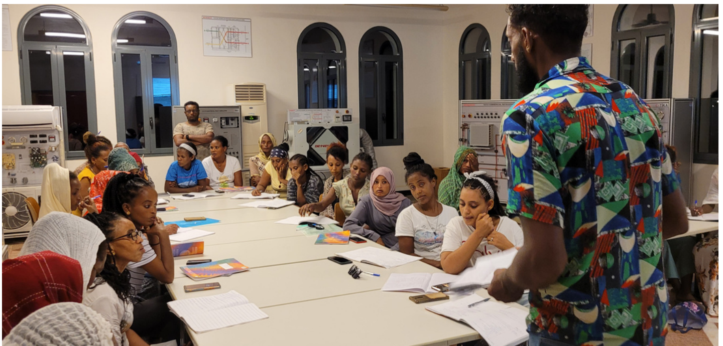
Hospitality/tourism/accommodation course, theoretical part