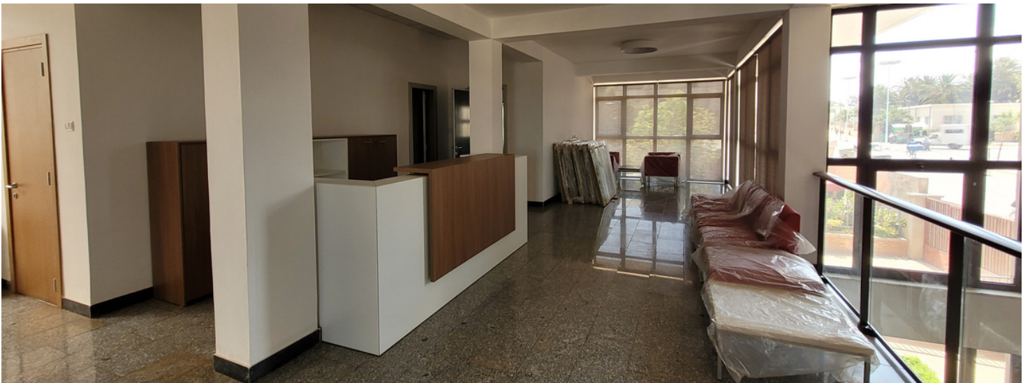
Setting up the interior of the Social Media Centre in Asmara