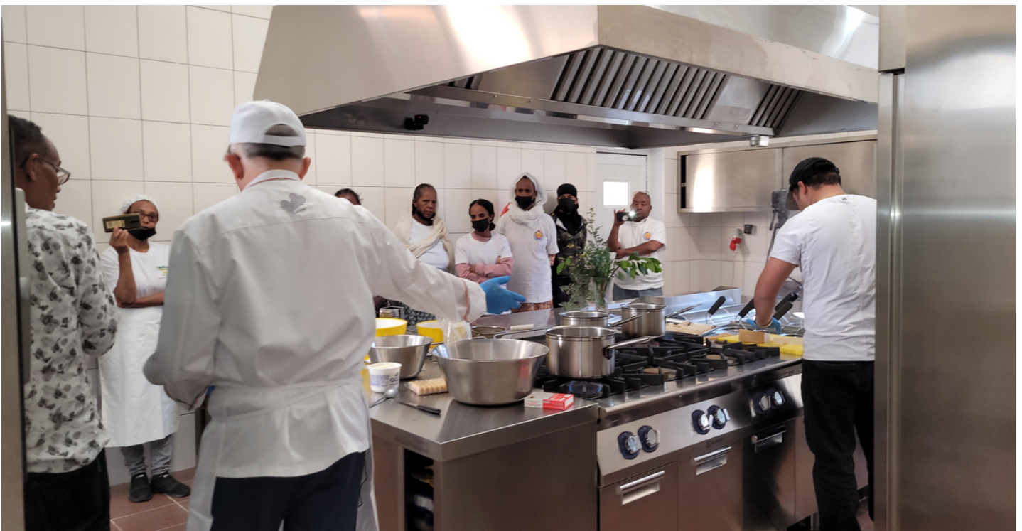
Course on 'Hazard Analysis and Critical Control Points' protocol - HACCP