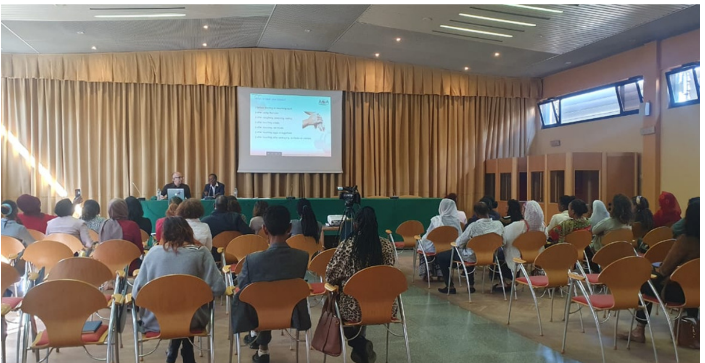
Course on 'Hazard Analysis and Critical Control Points' protocol - HACCP