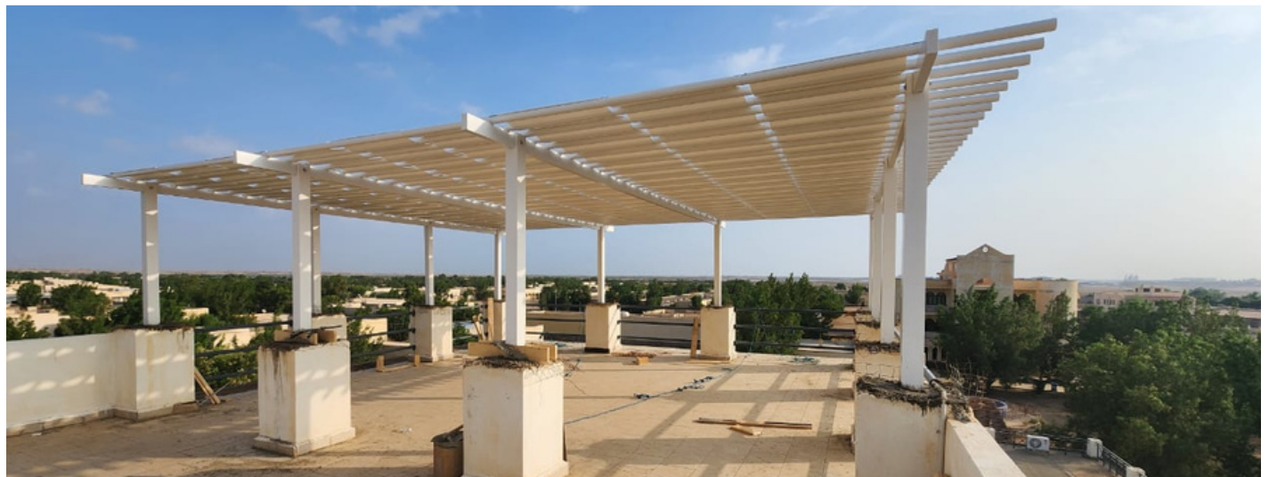
Exterior fittings (pergolas) of the Massawa Workers Vocational Training Center