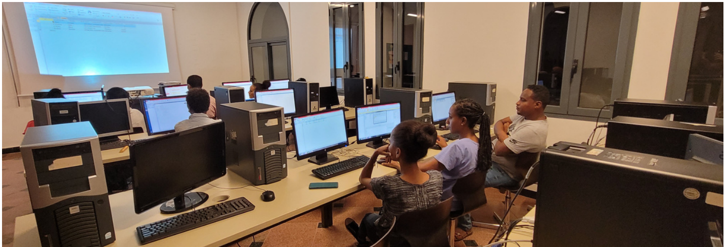
ITC course advanced level