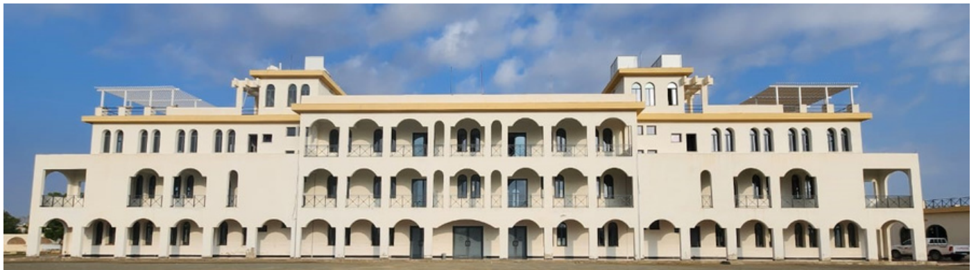
Massawa Workers Vocational Training Center (MWVTC)

Since its implementation, the kitchen has been used to run vocational courses for the project beneficiaries (and other participants) and to prepare food that is sold in the bar-restaurant adjacent to the centre. This offered the opportunity to create new professional skills and jobs, services and income-generating activities, with the ultimate aim of creating decent employment and income for the self-sustainability of the Social Media Centre in Asmara.