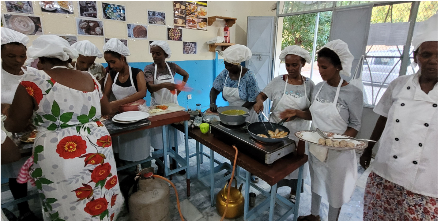
Cooking class in Massawa

We received a very friendly welcome and we could taste the excellent food made by the participants in our presence, which we ate together.