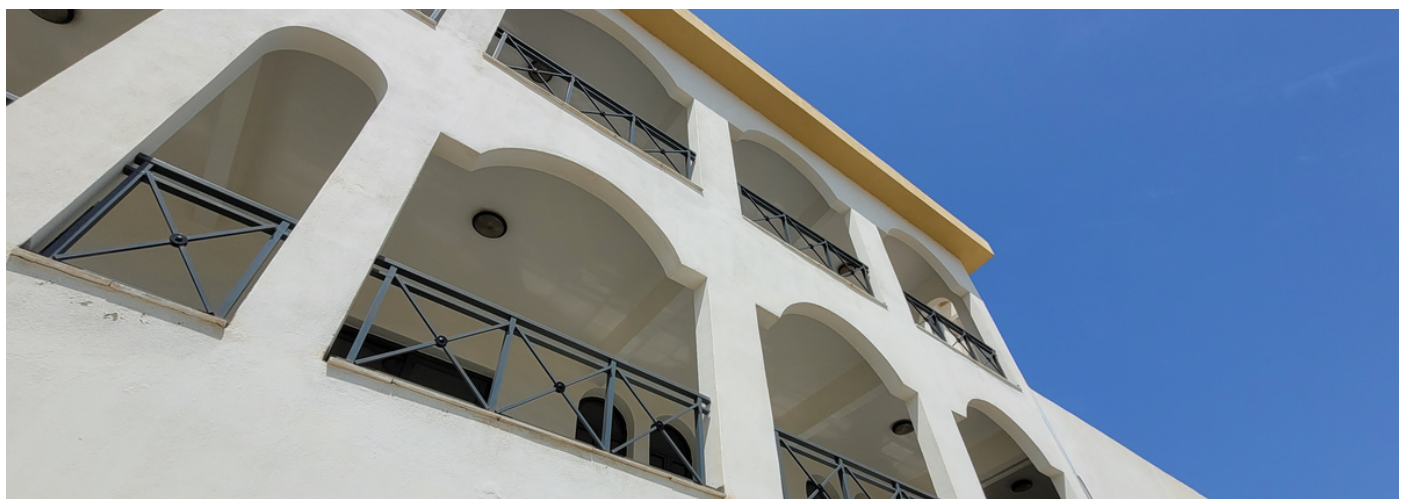
Outdoor railings of the Massawa Workers Vocational Training Center