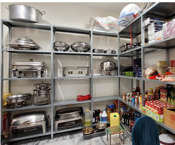
Equipment and tools for the professional kitchen of the Social Media Centre in Asmara