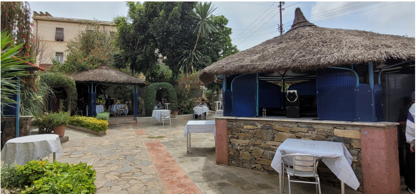
The outdoor spaces of the Social Media Centre in Asmara

The bar-restaurant adjacent to the kitchen of the Asmara Social Media Centre was provided with new, modern tables and chairs, smart TVs, and audio-visual systems. It is now a recreational space in the centre, a club with indoor and outdoor spaces, and a meeting place for citizens open every day. In just a few months, the bar-restaurant also became a venue for parties, weddings, public and private events.