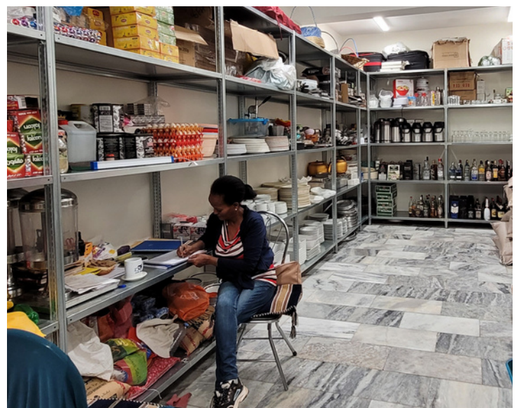
Professional kitchen warehouse of the Social Media Centre in Asmara